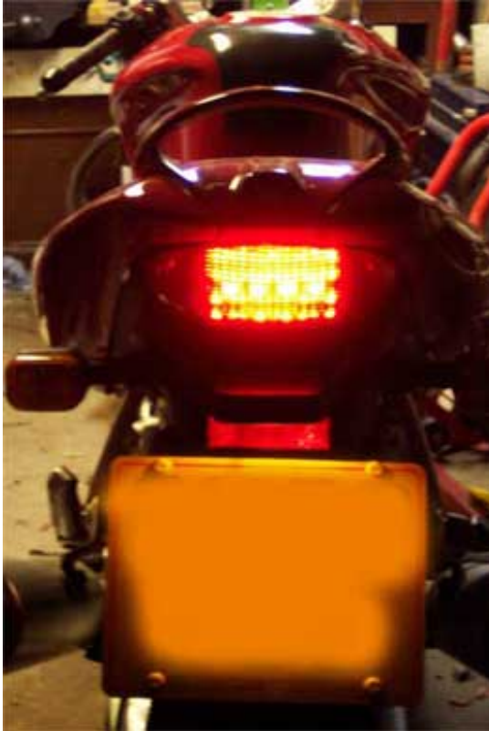
Tail light illuminated only.